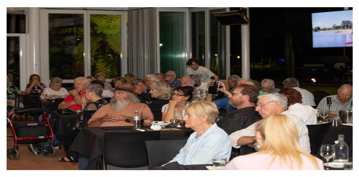
Our 2021 sailing award acknowledgements for the 2021 season were presented to,

2, DF 95 Christmas Function & Awards evening : On Thursday the 18 th of November our group and our wives/ Partners celebrated the end of our 2021 sailing season with our annual Christmas dinner and awards presentation evening which was held at the Emerald Lakes Golf club where we enjoyed an excellent meal a few drinks in a separate area of the club. The evening was a great success it was also well attended with 50 plus who all agree these social occasions should occur every three or so months, which we will do, so look out for the dates next year which will be detailed in the January 2022 Group news update.