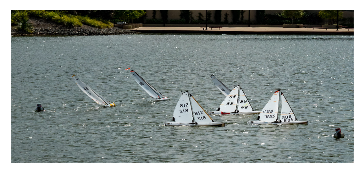
Club Scratch Racing has been the most popular form of competitive sailing activity in 2021

• Several members have asked when DF 95 Club sailing will recommence in the new year, it is planned to have our first Club Scratch Race Day on Friday the 14 th of January at Emerald Lakes. With set up at 11.15 am and racing underway at 11.45 / Midday.