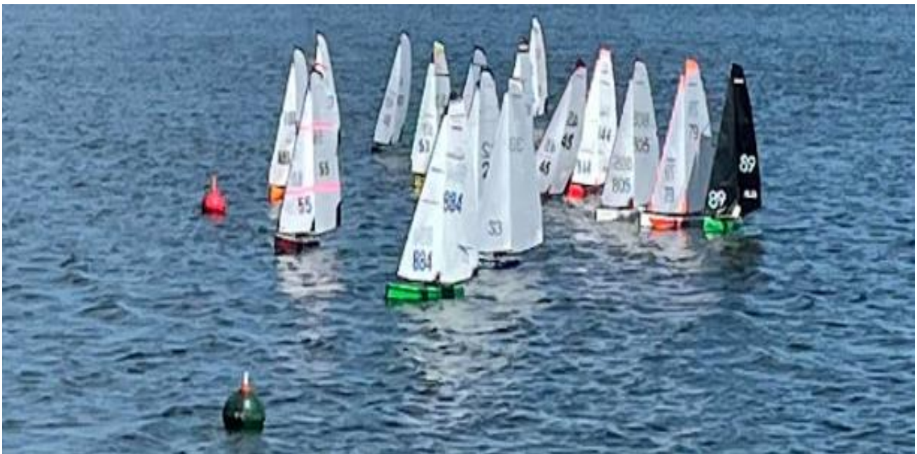
Australia Day Dragon Flite 95 Regatta attracts a good fleet for a fun day's sailing