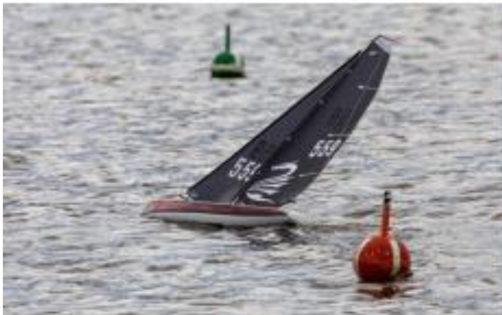
RC YACHT DP95 'Ichiban' #55