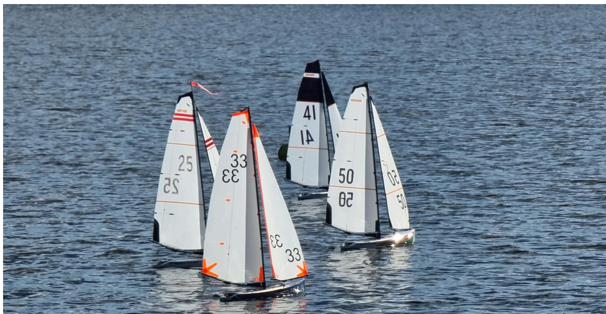
The GVRVC Team dominating one of the handicap races No 25 was the overall winner for the day.