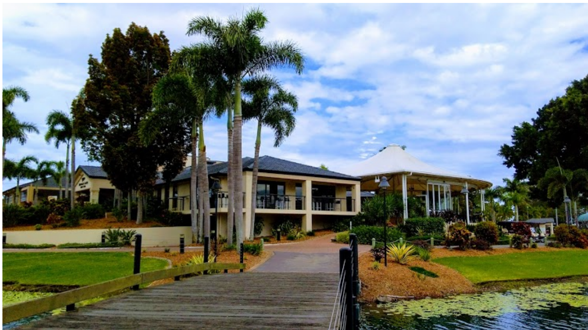
The Emerald Lakes Golf Club Premises

E, Thursday the 22 nd DF 95 Group drinks and dinner evening at the Emerald Lakes Golf Club at No 3 Alabaster Drive Carrara. You all are welcome to attend with your wives / Partners, or on your own, the dress code is smart causal and drinks start at 5.00 pm with dinner at 6.00 pm. Each person pays for their drinks and meal. If you have not already indicated to me your intension to attend, please let me know so we can extent the booking. We have at this stage approx. 28 people coming. There is plenty of parking within the Golf Clubs facilities outside the club house.