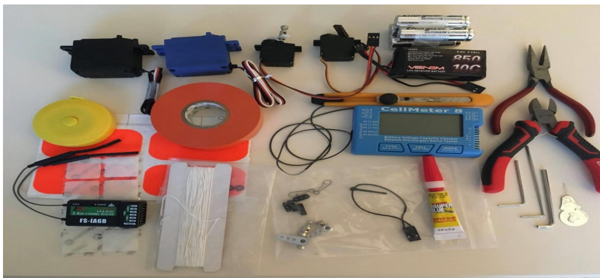
The key spare parts & Tools you need on race day to ensure you finish all races Programmed

Several members have asked about what items should they have on hand, as a general tool kit to carry out basic maintenance when an issue may arise during a race day. Having the key items is essential, such as spare Rudder Servos, Sail Winch, Batteries, Receiver, Battery tester, some Super Glue, Self-Adhesive tape, plus tools, long nose pliers, scissors, Screw Drivers, Allen keys and spare Dyneema cord being the main items that will allow you to continue sailing on the day