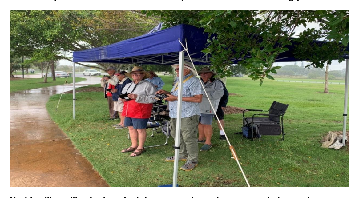
Nothing like sailing in the rain, it is great we have the tents to shelter under

Sailing over the past few weeks in February has seen a lift in fleet numbers as our new members get their new boats into the water. The weather has not been very kind or cooperative, it has either been pouring with rain, strong gusty winds, or as experience last Sunday little to no wind and what wind we had come from either the South or from east that made setting a true windward leeward course extremely difficult especially for our team members who lay the marks. However, the weather conditions we are presented with on day are what we have to live with, and learn to sail accordingly.